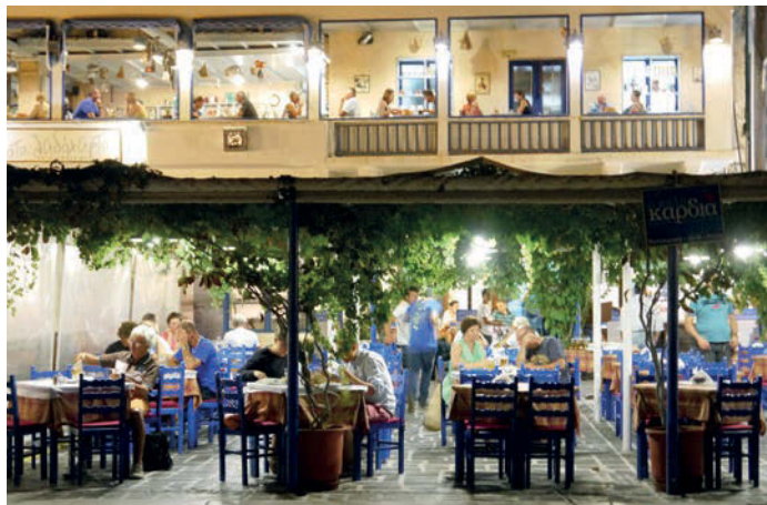
Naxos Town taverna