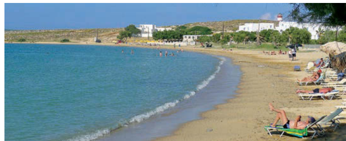
Agii Anargyri Beach

The Hotel: 3 Star Room Only Air Conditioning Free WiFi