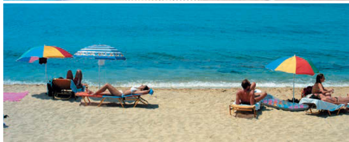
Beach at Plaza Beach Hotel