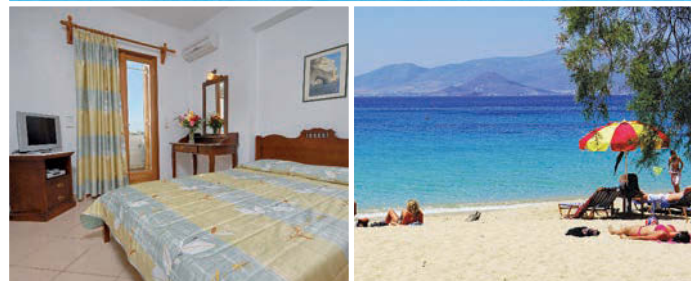
Aghios Prokopios beach